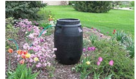
Black Regular Overflow Rain Barrel

Municipal Programs For Rain Barrels, Tumbling Composters, And Potting Benches